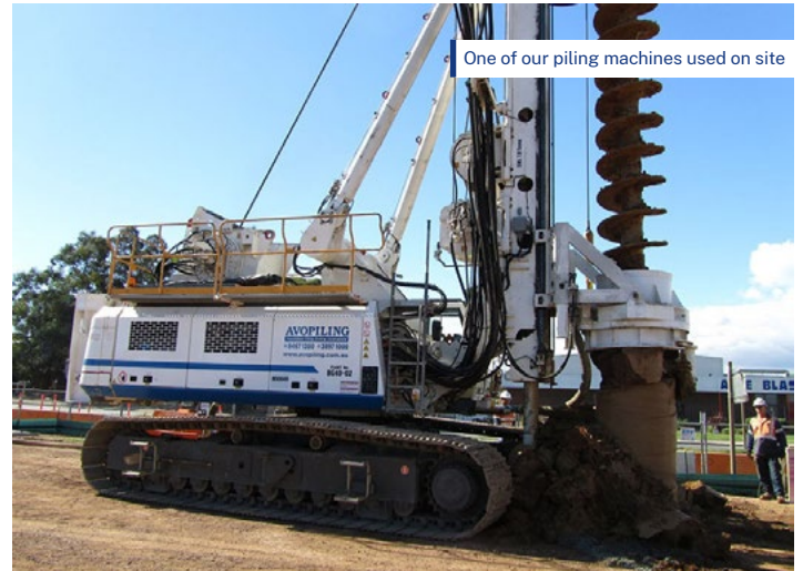
One of our piling machines used on site

For an interpreter, call 131 450 and ask them to call 02 9978 5402